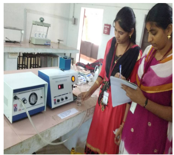
Figure-3: Sodium, Potassium, Calcium by Flame photometer Test