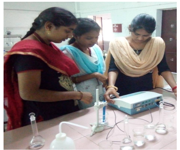
Figure-2: pH Test in Laboratory

Website: <u>www.ijirset.com</u> Vol. 6, Issue 3, March 2017