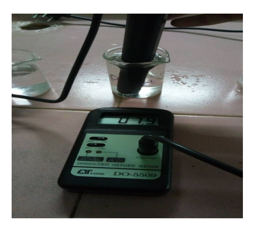
Figure-2 : DO Test in Laboratory